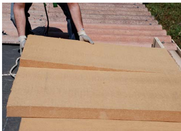
Laying examples of guttatermic® BIO as under-roof thermal insulation.